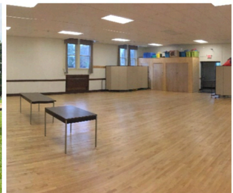
TOWN HALL GYM