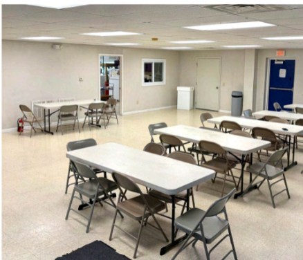
CHARLIE MAIER LODGE