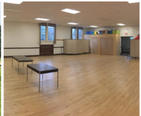
TOWN HALL GYM