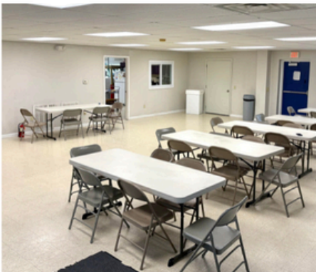
CHARLIE MAIER LODGE